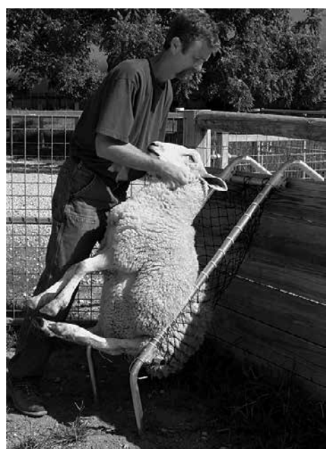
You neither need, nor should, lift sheep into a chair. Instead push it backwards by the neck/head until the butt end falls into the chair. Then lift up the head and tip it back into position. Using a small pen instead of a large one will make catching the sheep much easier. Also helps to have the chair near the corner of the pen.